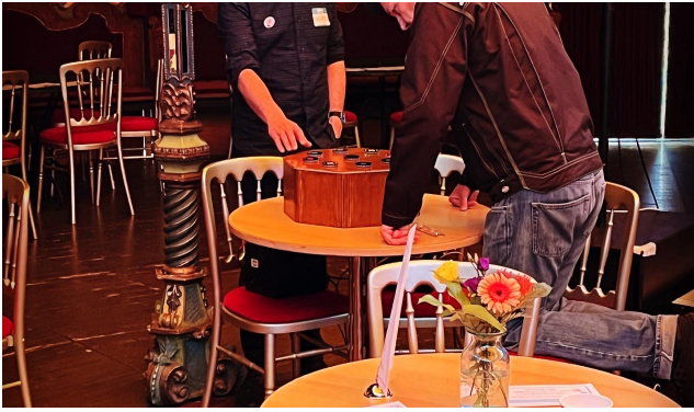
Figure 5: Involvement Activities - In C Box