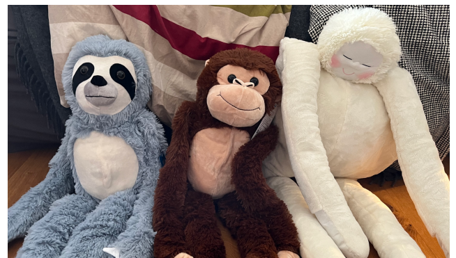
Figure 4: The Hug (right) [38], and our 'hacked' soft tech

We explored notions of comfort and intimacy mediated through musical and sonic interactions and uncovered the desire for personalisation and sharing of the experience with others.