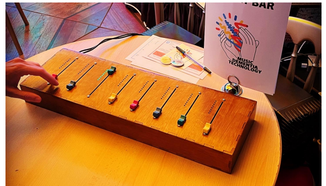
Figure 3: The SliderBox

We wanted to borrow from known interaction metaphors and in previous involvement activities the 'Mixing-Desk' was discussed as a familiar musical, technological and cultural object. Within this design space, considerations were made from visual and dextral impairment. The interface was kept as uncluttered as possible with no additional interface elements than the 8 sliders, which were spaced farther apart than commonly found and later colour coded to provide some differentiation within a repeating interface.