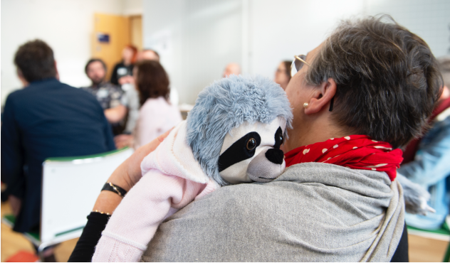
Figure 1: Involvement Activities - The 'hacked' Hug

To address this while providing agency and independence to users, we have trialed a safe stop control that is clearly signposted and tested by users early in the development of their relationship with a device.