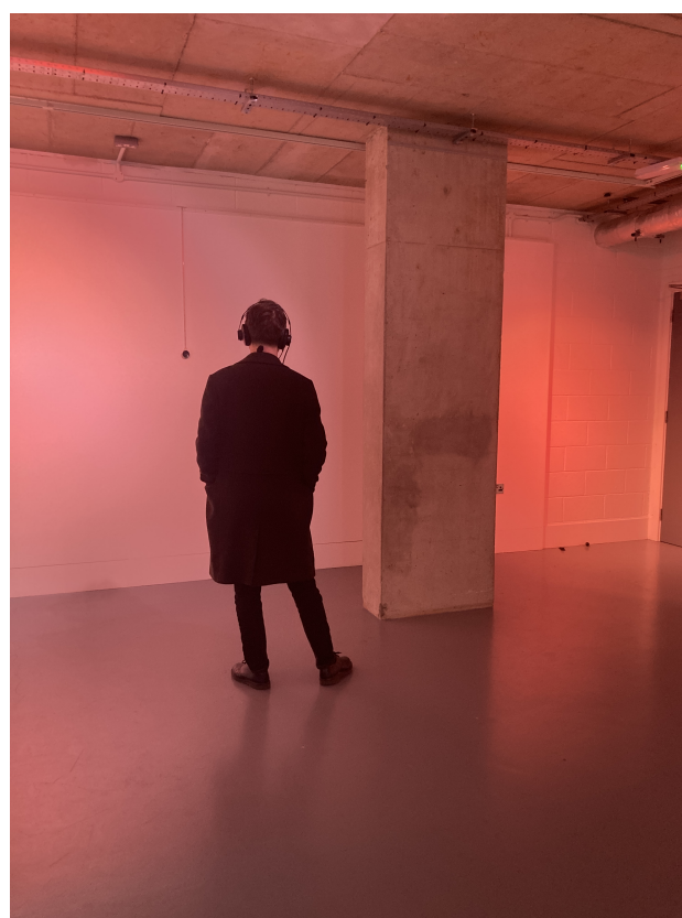
Figure 2: Listening to Sonographies