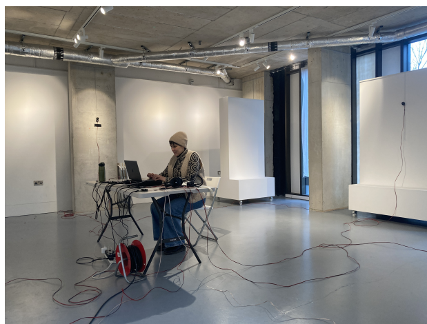
Figure 3: Working in-situ at no format Gallery

The windows also change the experience of listening. Eva notes how the installation becomes a soundtrack to the observed. This experiential effect is at odds with the intended focus on embodied experience and awareness of sound inside the gallery. It is clear that windows must be covered and that curatorial interventions will be needed to alter the gallery space in the service of design intentions.