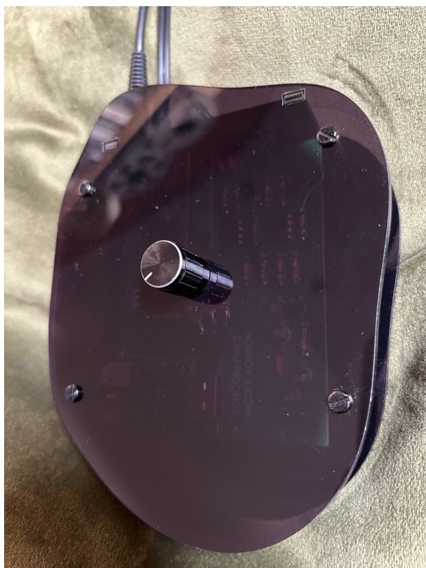
Figure 4: The perspex form housing electronic circuitry

background, a mere canvas upon which to hang artworks. Its materiality contributes meaningfully to the art experience. This is discerned by the listener because while the interventions are subtle, they are clearly intentional and, therefore, brought into relation with the sonic. Equally, housing the electronic circuitry in an organic form (see Figure 4) brings the object into the aesthetic sphere of the artwork, part of the experience and specific to the act of listening to Sonographies , rather than a generic tool that might be transferred to other settings.